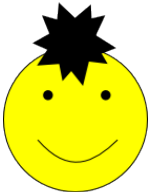
Fig. 2. A bitmap graphic loaded from a PNG file