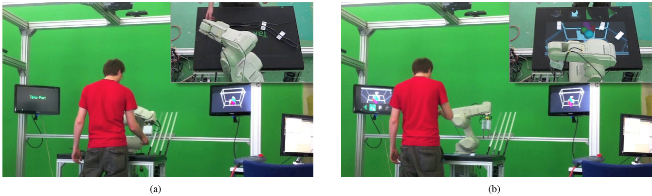
Fig. 2. Human Robot Collaboration Plattform. The human can interact with a collaborative robot in a natural manner. The workspace is augmented with multiple screens showing the system status and instructions to the human. (a) The human receives a part from the robot. (b) The human can interact with the system using virtual buttons projected on the work desk.